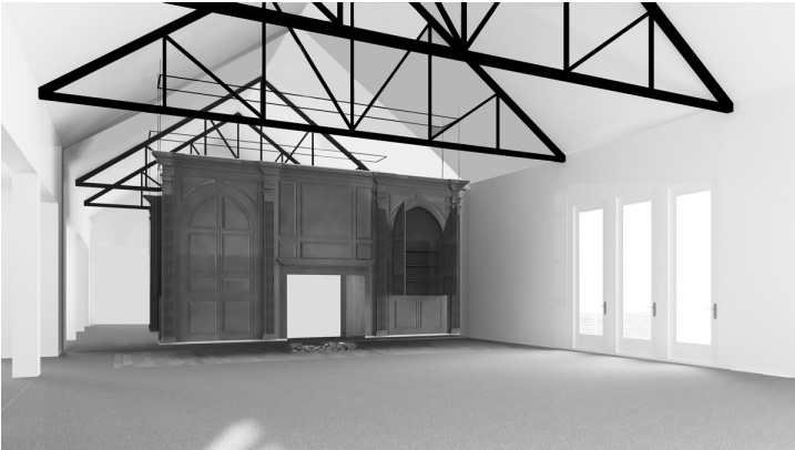
The planned interior of the Forever the 4 th Gallery that will display the Ross Hall Wall at the Metlar-Bodine House Museum

Independence Day in Piscataway, make sure to tag your social media posts with #First4th.