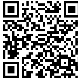
Monday, July 3 rd

Raritan Rapids – Our 2023 season tentatively begins on Memorial Day weekend with its special Saturday, Sunday & Monday hours of Noon-4 p.m. Entry is included in YPCC memberships while non-members and guests of members are welcome with an entry fee. Please check the YPCC website for more details including its open days & times.