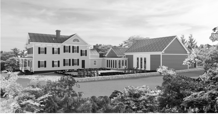
An artist's rendering of the Metlar-Bodine House Museum with the Forever the 4 th Gallery that will house the Ross Hall Wall