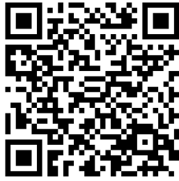
Monday, May 1 st

Blood Drives on Monday, May 1 st and Monday, July 3 rd from Noon-6 p.m. Scan the QR codes below to sign up. Give blood and save a life!